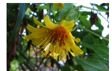
Bidens cosmoides: attracts birds, flies and bees