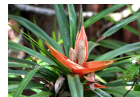
Freycinetia arborea: attracts birds, bees and wasps